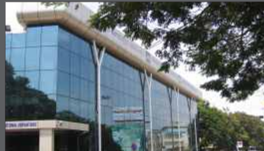
BANGALORE INTL AIRPORT - HAL