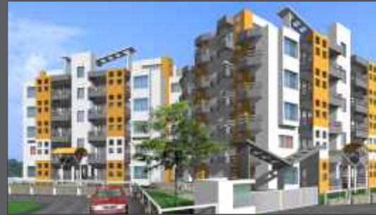
HARA VIJAYA VALLEY VIEW - V